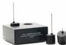
PHILOG PRESSURE AND TEMPERATURE LOGGER