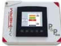
P&P BOX DEFORMATION