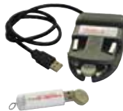
AXIMINI AND AXIMICRO MINIATURIZED TEMPERATURE LOGGER