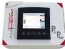
P&P Box TEMPERATURE