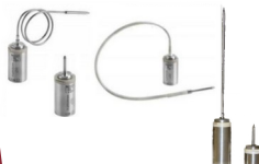
Loggers with temperature rod