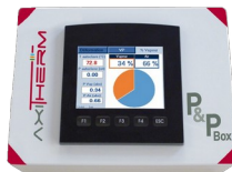
P&P Box Temperature