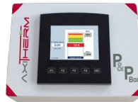
P&P Box deformation