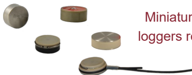
Miniature and loggers rodless