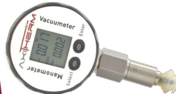
Digital manometer / Vacuum meter